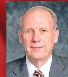
MAYOR RON BIGELOW 2020