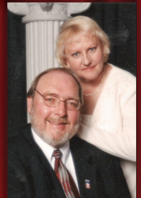
SENATOR KAREN MAYNE & FORMER SENATOR ED MAYNE (posthumously) 2017