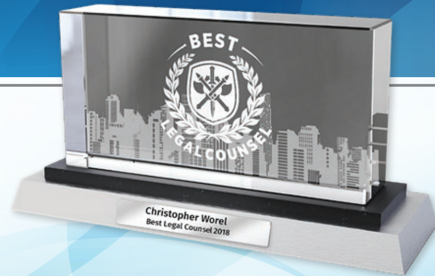
Lobby Crystal Trophy with Aluminum Base